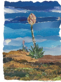
Artist Abby Diamond